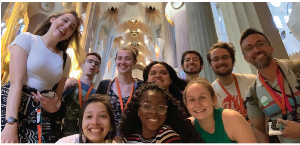
« HOOD STUDENTS DURING THEIR TRAVEL ABROAD EXPERIENCE