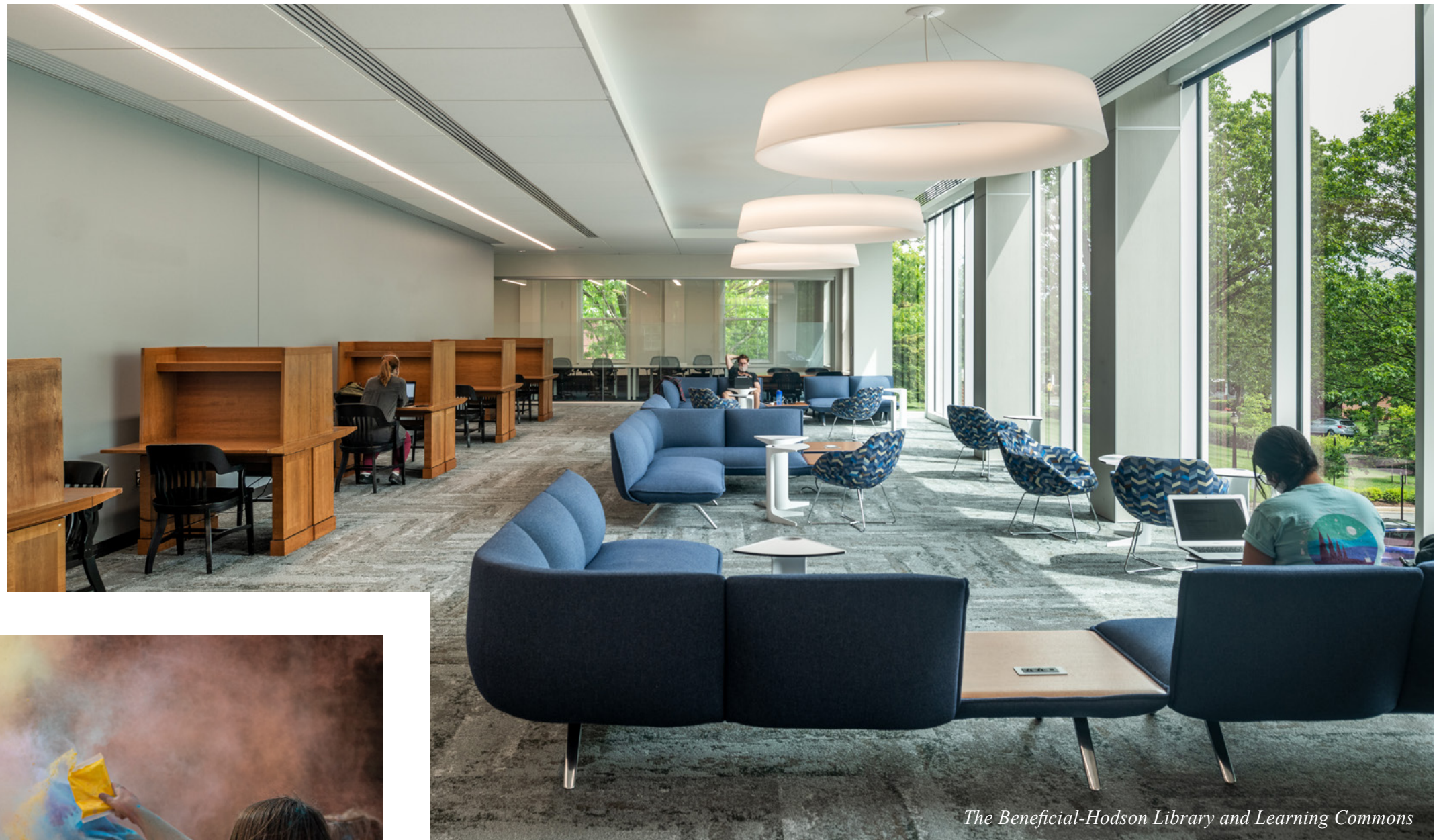
The Beneficial-Hodson Library and Learning Commons

In addition, Hood College offers two doctoral degrees, namely organizational leadership (DOL)