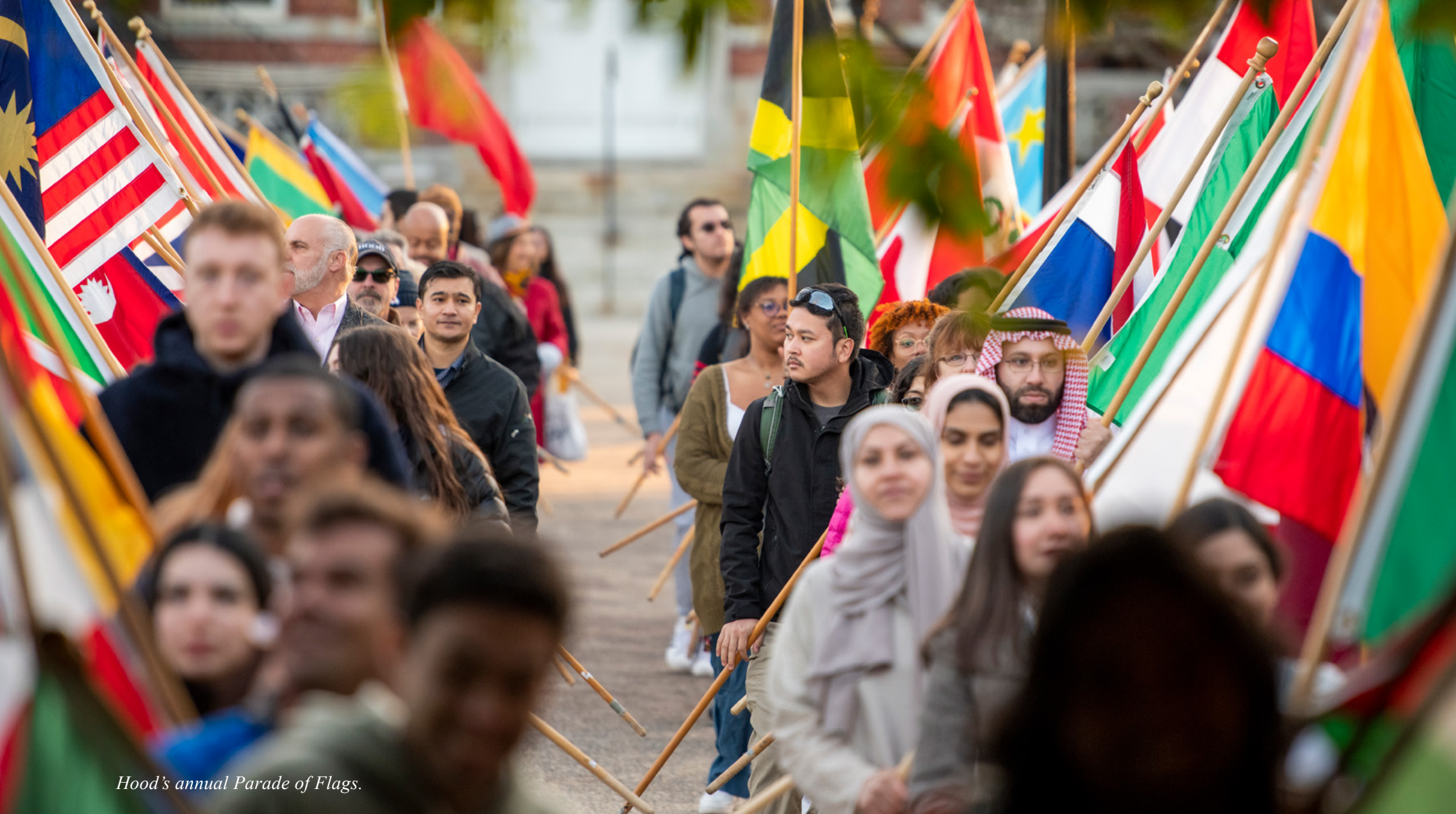
Hood's annual Parade of Flags.