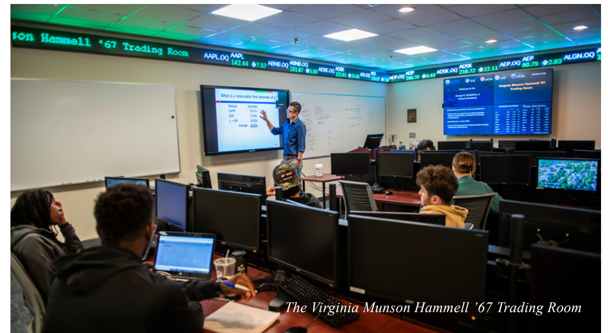
The Virginia Munson Hammell '67 Trading Room