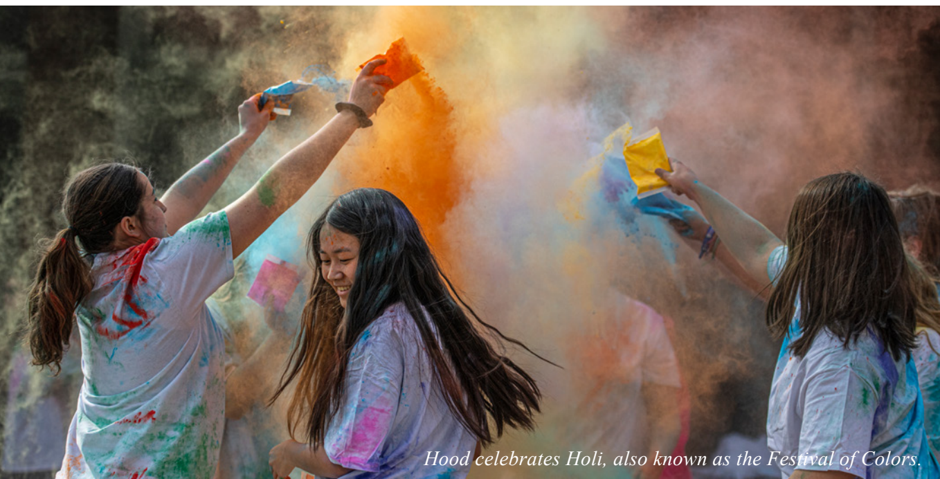
Hood celebrates Holi, also known as the Festival of Colors.

and business administration (DBA), which are highly coveted by international students seeking to pursue advanced research and scholarship. The institute's distinguished faculty members, who are experts in their respective fields, provide unparalleled mentorship and support to our doctoral students throughout their academic journey.